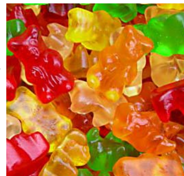
2008 AIChE National Student Conference & Centennial Celebration

Check out the Highlights of Happenings section on the back page for upcoming events sponsored by the CBEE Student Organization.